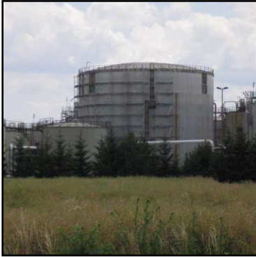
10600 m 3 tank