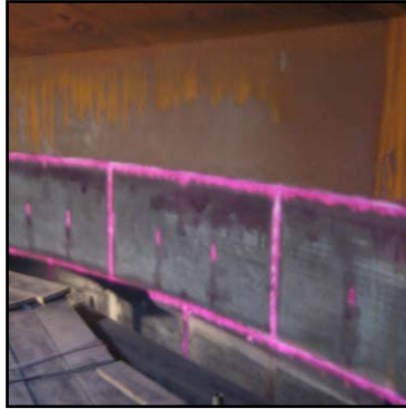
Welded steel plates during crack testing