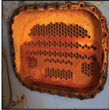
The corroded tube sheet.