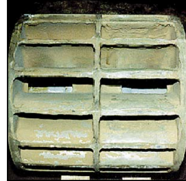
Rotor after many years in service