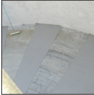
Application of Belzona® 4111