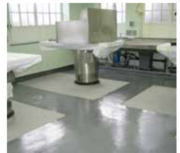
Concrete floor after