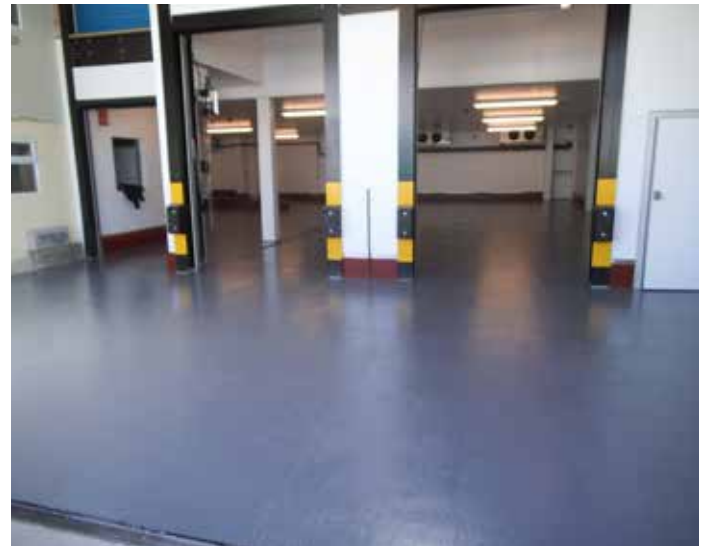
Dairy warehouse floor restored with Belzona 5231

This solvent-free system is easy to mix and apply by roller, without the need for hot work or specialist tools.