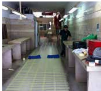
Tiled floor before