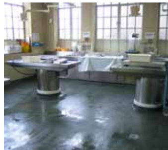
Concrete floor before