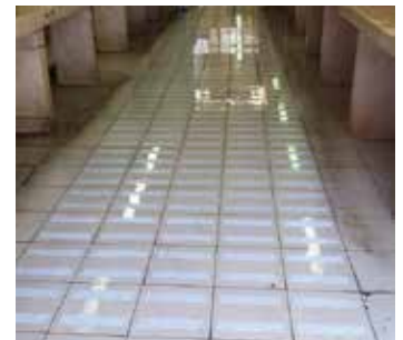
Tiled floor after

For more information, please contact your local Belzona representative: