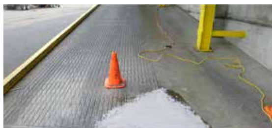
The Belzona 4151 + 4111 system was used to rebuild and smooth the cracked area