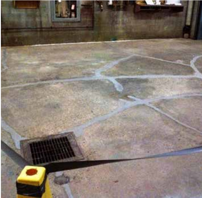
Crack repaired with Belzona 4151 and 4111 system

Belzona 4151 (Magma-Quartz Resin) is a two component coating suitable for protecting concrete substrates from moisture ingress and chemical attack.