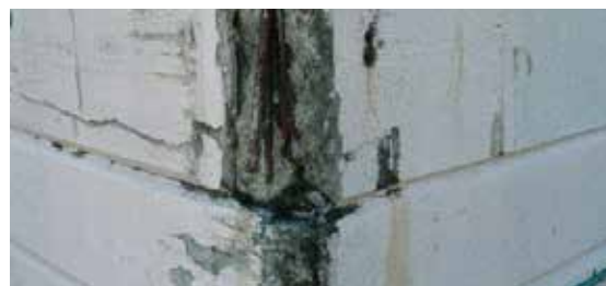
A wall corner was severely damaged