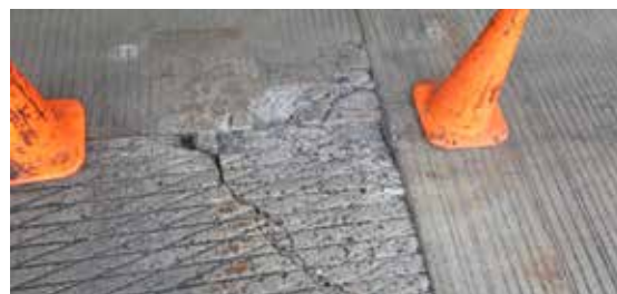
A concrete panel had cracked causing problems on the road

Excellent bonding to metallic and masonry surfaces including concrete, brick, marble and stone.