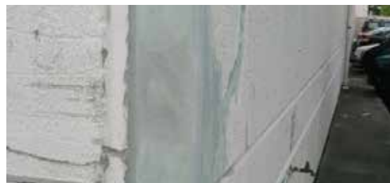
Belzona 4151 was injected before cracks were filled with Belzona 4111

For more information, please contact your local Belzona representative: