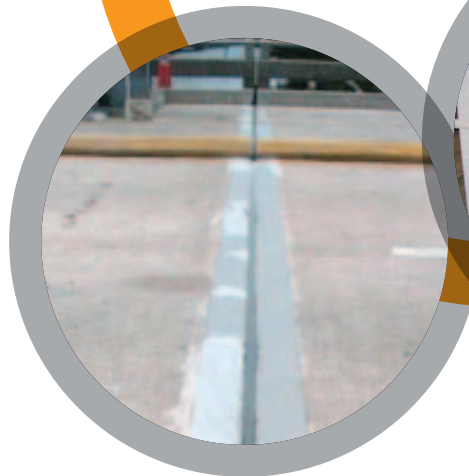
Bridges & Roadways