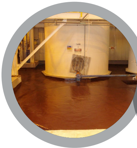
Chemical Containment Areas