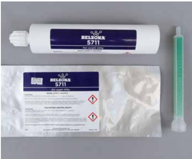
Belzona 5711 supplied in cartridge with static mixer.