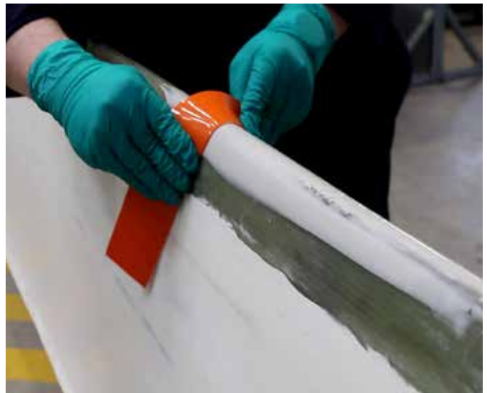
Easy to contour leading edge, no need for sanding.

For more information, please contact your local Belzona representative: