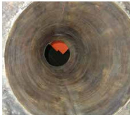
Steel cone before coating