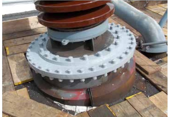
Belzona 5831 used for transformer oil leak sealing

Can be used as a complete repair solution in combination with Belzona 1161, a paste grade repair composite.