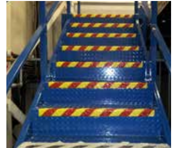
Metal stairs after