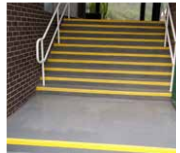
Concrete stairs after

For more information, please contact your local Belzona representative: