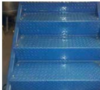
Metal stairs before