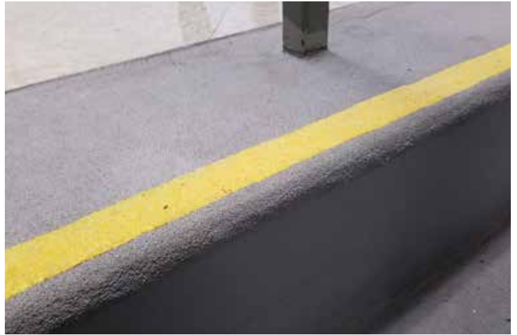
Close-up of Belzona 4411 after over one year in service

This system is easily brush-applied without the need for hot work or specialist tools.