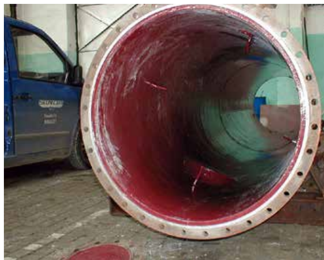
Further protection applied to a chemical reaction tower