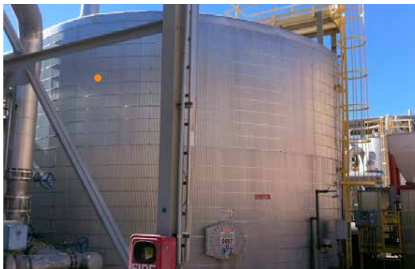
Belzona 4331 can be applied as a lining to protect tanks

For more information, please contact your local Belzona representative: