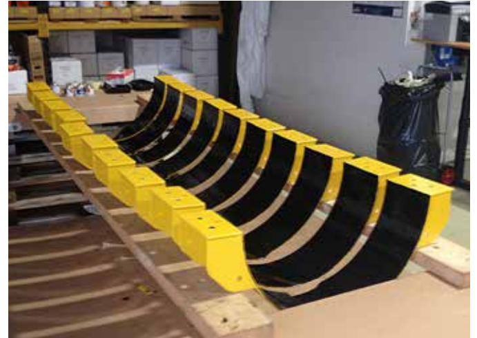
Splash zone clamps coated