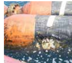
Floating hose repair