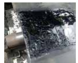
Conveyor belt repair

For more information, please contact your local Belzona representative: