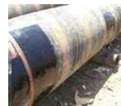
Floating hose repair