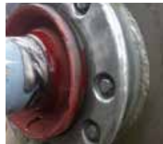
Transformers leak sealing