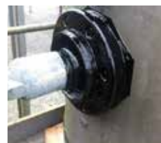
Transformers leak sealing