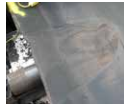
Conveyor belt repair