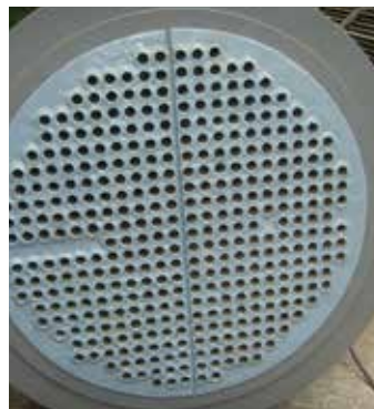
Heat exchanger protection

This solvent-free system is applied using simple hand tools to areas requiring maximum erosion resistance.