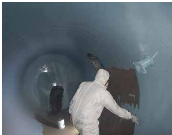
Belzona 1391T applied manually

For more information, please contact your local Belzona representative: