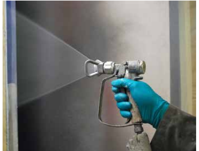
Belzona 1381 can be sprayed with negligible wear to the nozzle

Belzona 1381 is capable of high-build spray application (> 1250 microns) in a single coat without sagging.