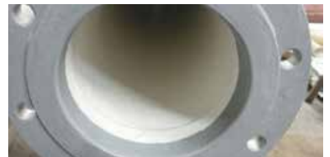
Before, during and after an application of Belzona 1381 being spin-sprayed on the internals of pipes

For more information, please contact your local Belzona representative: