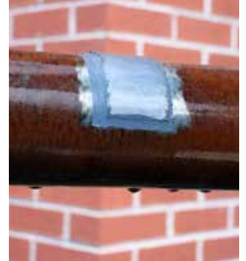
Application to wet, or oil contaminated surfaces