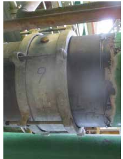
Reinstalled repaired coupling

For more information, please contact your local Belzona representative: