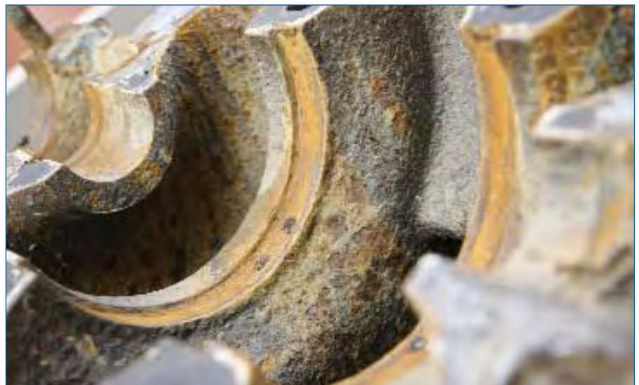
Worn and damaged pump awaiting repair