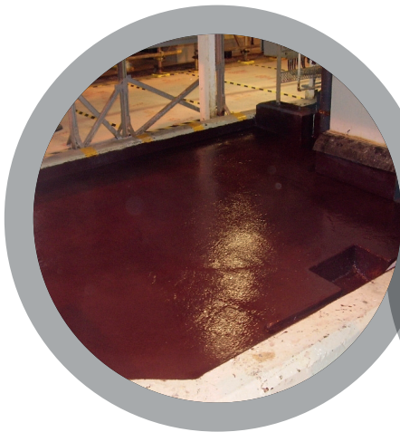
Chemical Containment Areas