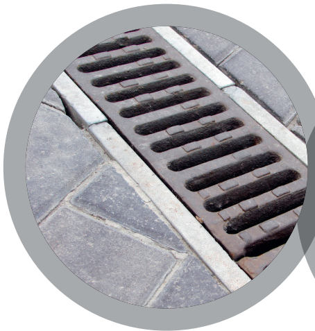
Channels and Gratings