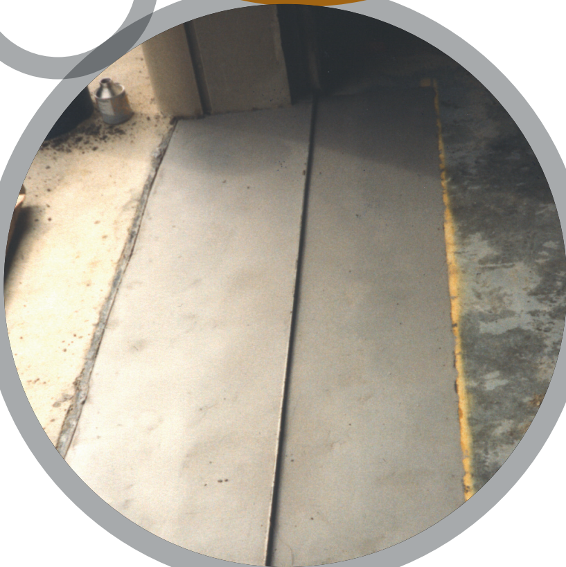
Floor Problem Areas

For more information, please contact your local Belzona® representative: