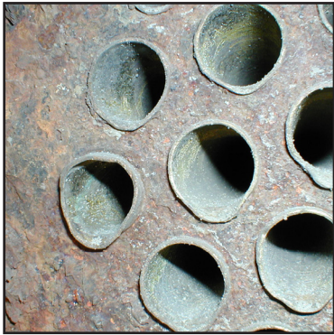
The corroded tube sheet