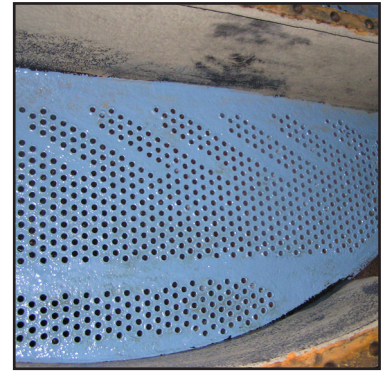
Application after 3 years (still like new)