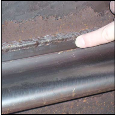
Leaking Expansion Joint