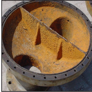
Rebuilding the division bars