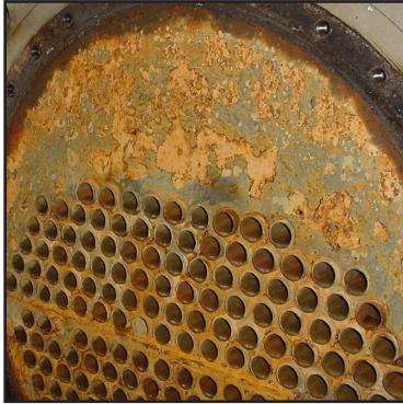
The corroded tube sheet