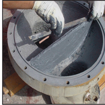
End cover being coated