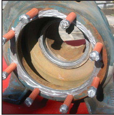
Another view of profiles