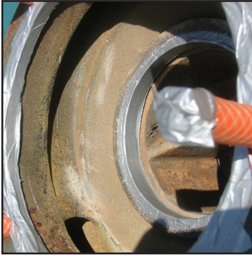
Rebuilding profiles underway