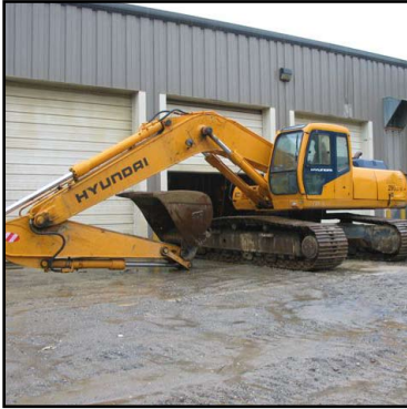
Excavator unable to rotate