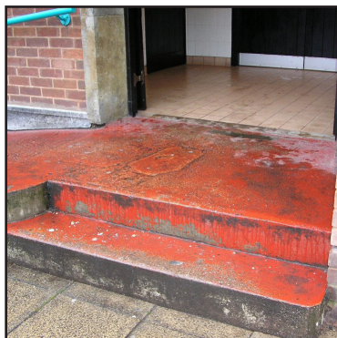
Worn steps were a health and safety hazard