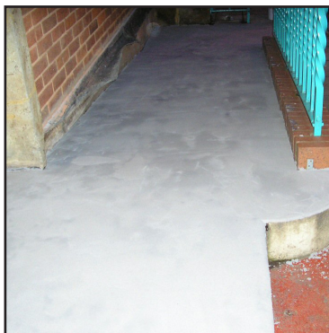
Surface rebuilt with Belzona® 4131