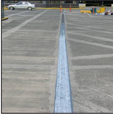
Application in progress - 1st coat with Reinforcement Sheet in place