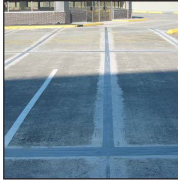
Application of 2nd coat in progress