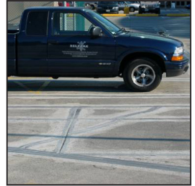
Completed section of deck