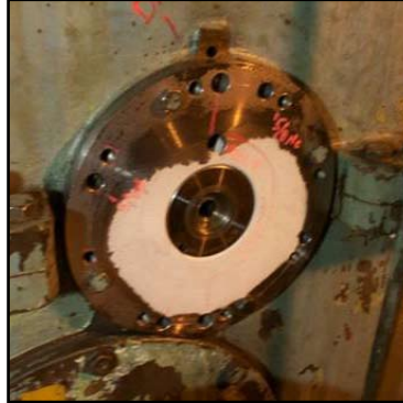
The mold was positioned carefully before injecting Belzona 1321