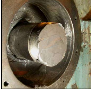
The bearing fit area ground to provide a rough surface and degreased with Belzona 9111