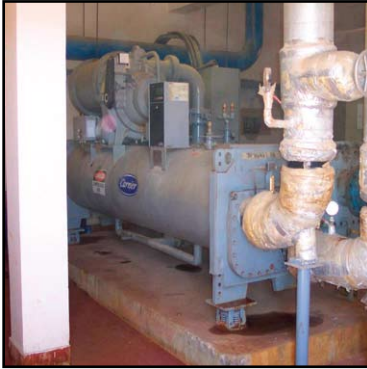
General view of the refrigeration unit.