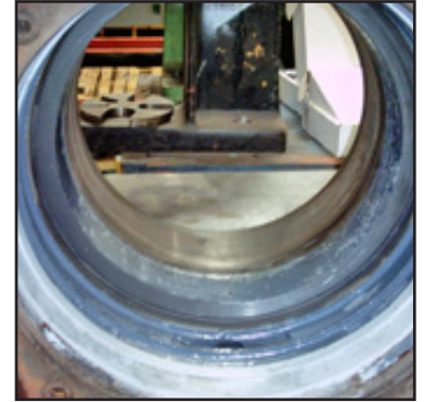
Ready for service