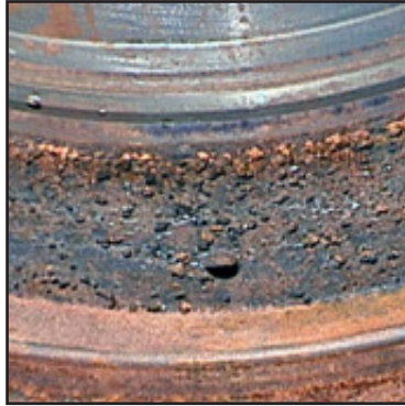
Pitting corrosion in water jacket area