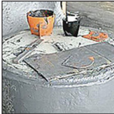
Rebuilding with Belzona® 1121 (Super XL-Metal)