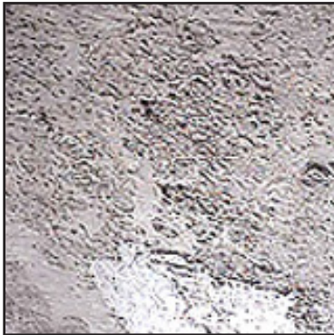
Cavitation clearly evident