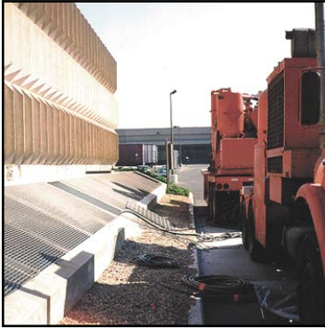
Outside view of the tower, drainage, and clean-up begins.