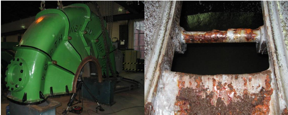
Image -2 Pump casing mounted on blocks

Due to the physical size and weight of the top half of the pump casing, it was not practical to turn the casing over, therefore, the casing was mounted on blocks (supported by the crane for safety) and scanned from underneath. During this inspection, each casing was identified as having Substrate Corrosion To Rust Grade D. This is the highest level of corrosion grade on the scale, indicating severe rusting of the cast iron and pitting. (ISO-8501-1)