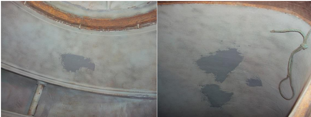
Images 9&10- Substrate rebuilt with Belzona 1111

Once the substrate had been tested for salt contamination, the application areas were masked out ready for the application of Belzona 1111 (Super Metal). Applied using a Belzona applicator, this material was used to rebuild the areas of undulation and pitting damage. A solvent free epoxy resin reinforced with silicon steel alloy, this repair composite provides robust corrosion resistance and will ensure the substrate will remain protected when it comes into contact with abrasive material.