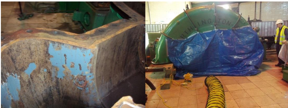
Image 8- Pump casing prior to removal of existing coating Image 10- Sponge Blasting in progress

Firstly, all machined faces were protected from the blasting process before Sponge Blasting equipment was used on the upper and lower casings. This was used to remove the previous coating, create a substrate cleanliness of at least SA 2 ½ and produce a surface profile of no less than 75µm. The application area was then vacuumed and examined to make sure it was dust free and all the blast media was removed.