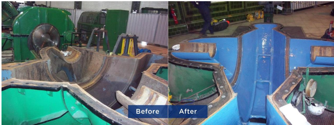
Image 1- Pump casing before and after Belzona application

Every day, the Queen Mary Reservoir holds 910,000,000 litres of water. The water is drawn in from an intake channel fed from the Thames, before it is turned into enough fresh water to supply one of the busiest cities of the world. After nearly a century of activity, and following several refurbishments to machinery and equipment throughout the years, the centrifugal pumping system was ready for another major upgrade.