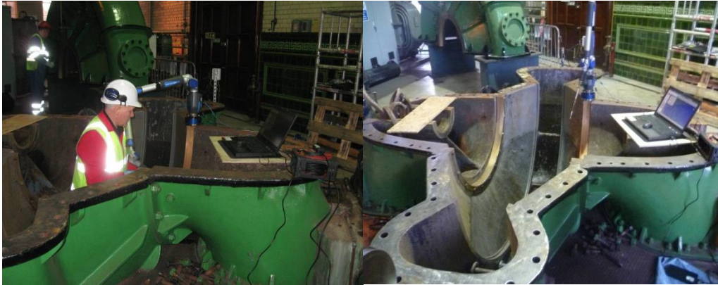
Image 4&5- Lower casing being scanned to capture hydraulic details