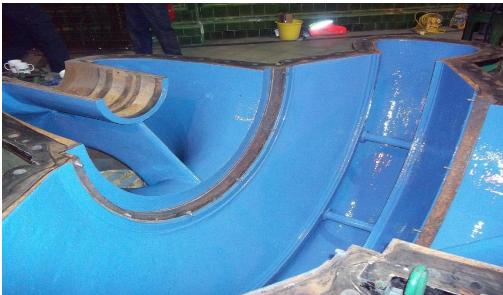
Image13- Completed application

By using modern polymer technology, Belzona was able to restore the centrifugal pumping equipment and ensure the historic Queen Mary Reservoir was back to running as smoothly and efficiently as possible.