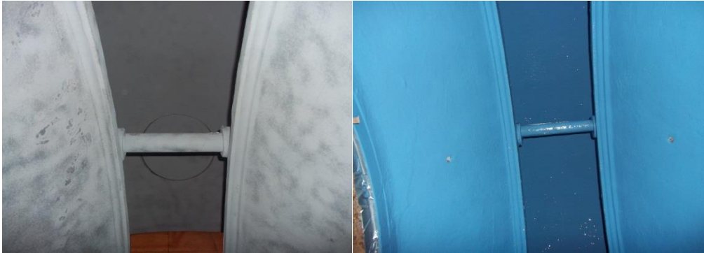
Image 11- Pump casing after Sponge Blast