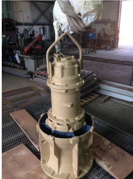
Sludge pump lifespan keeps on extending

Regardless of the pulping methods, paper mill pumps are put under immense strain due to the transfer of viscous material throughout the pulping process. Together, the sludge and slurries combine a high solids content, copious amounts of entrained air and often processing chemicals, resulting in issues associated with erosion, corrosion and chemical attack. In 2010, at an Italian paper mill, the casing and internal components of a cast iron submersible sludge pump were suffering from particular problems relating to these effects. In fact, the pump was barely lasting a maximum of two years in service before requiring major overhaul and replacement.