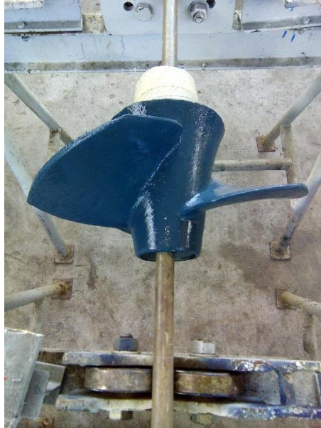
Pump components recoated to ensure functionality continues

Originally coated in 2010 with Belzona, six years on the customer opened the pump for mechanical maintenance. Throughout its six-year service life, the pump faced zero downtime due to Belzona erosion-corrosion protection and impressively, the coating was found to be in excellent condition. However, it was decided to refresh the coatings in order to prepare the pump for more years of service in sludge; therefore, the original coating was roughened before applying a new layer on top. Not only did this continue to extend the pump's in service life further, saving the company replacement costs, but ensured that the equipment was protected in the long term against the dangers of erosion-corrosion.