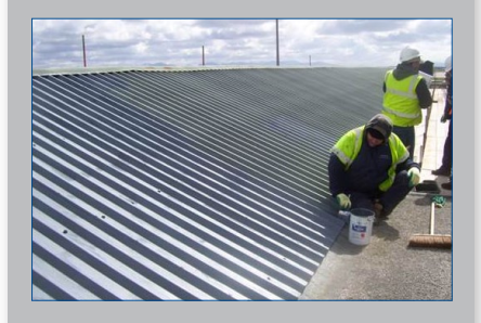
Complete supply and apply package

Through a global distribution network covering 120 countries, Belzona can provide a full 24 hour service as well as guidance and technical advice on the application of Belzona products. To find your local distributor, visit Belzona.com.