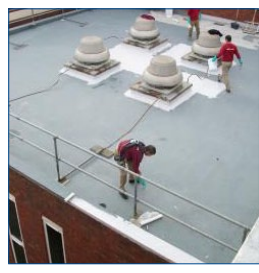
Belzona 3111 application in progress