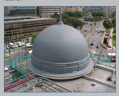
Follows complex contours

With its ability to provide impermeability to liquids, but permeability to water vapor – allowing the roof to breathe – this product offers a solution to roof leaks