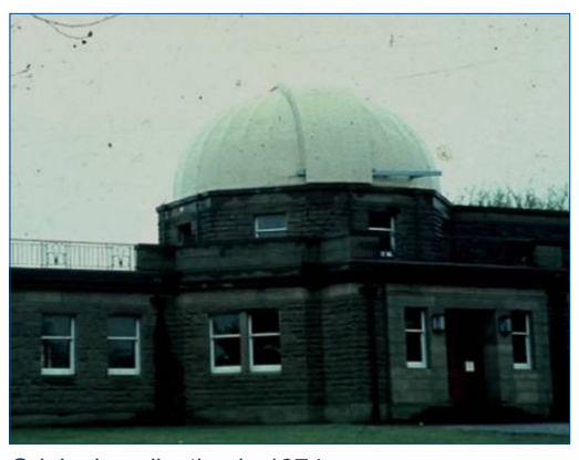
Original application in 1974

Following a recent visit, the dome was found to be in perfect condition and continues to uphold exceptional weatherproofing protection.