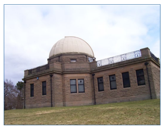
Application revisited in 2010