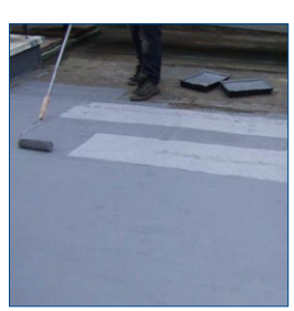
Easily applied by brush or roller