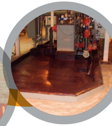
Chemical Storage Areas