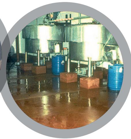
Machinery Production Areas