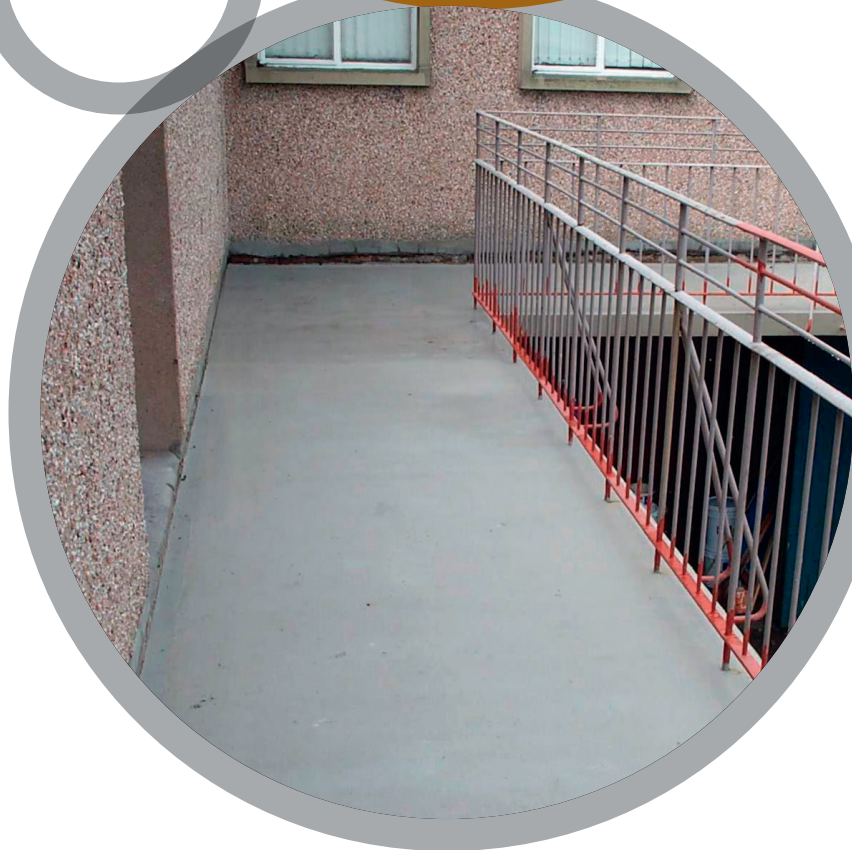
Floors and Walkways

For more information, please contact your local Belzona® representative: