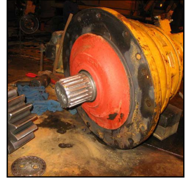
Worn gear and drive