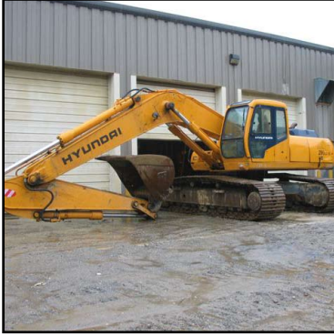
Excavator unable to rotate