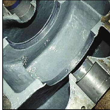
Rebuilt wear ring seat and stuffing box