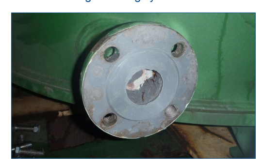
Flange face forming completed