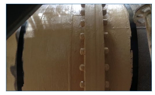
First layer of Belzona 3411 applied