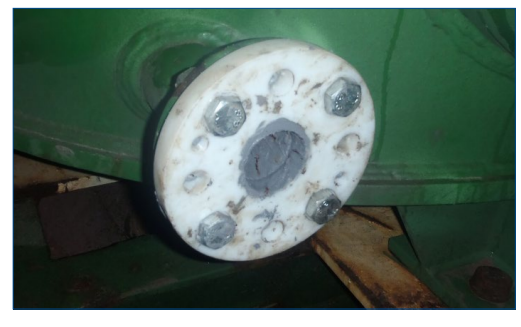
Former in place with Belzona material

The Belzona flange face forming solution was chosen for this repair as it does not require hot work or replacement flanges and it can be rapidly performed minimising downtime. After the surface on the flange face was prepared, the selected Belzona material was mixed and applied to the damaged surface and to the former, pushing the material well into the prepared profile. Both surfaces were brought together and once the correct level was achieved the former was bolted to the flange. Once the product was sufficiently