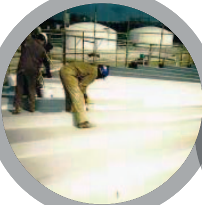
Encapsulation of Insulation