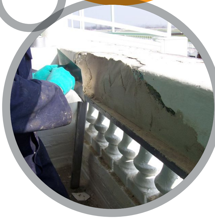
Ornate Stone Repairs

For more information, please contact your local Belzona® representative: